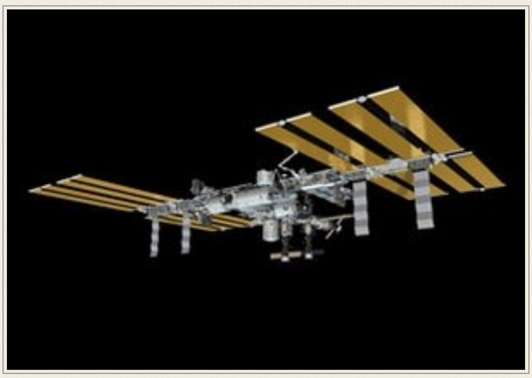
Figure 1-1. <a href="http://www.raumfahrer.net/raumfahrt/iss/home.shtml">http://www.raumfahrer.net/raumfahrt/iss/home.shtml</a>